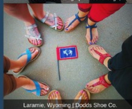
Laramie, Wyoming | Dodds Shoe Co.

In honor of Independence Day, we want to celebrate the patriotic spirit of your Main Street!