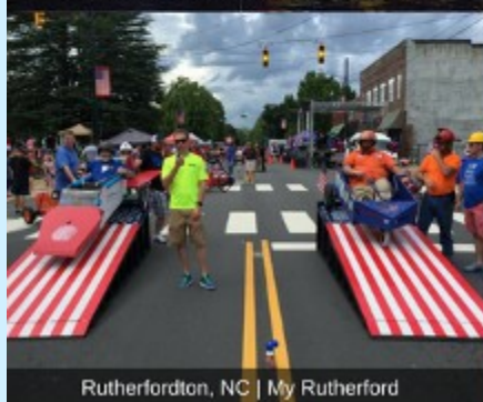
Rutherfordton, NC | My Rutherford