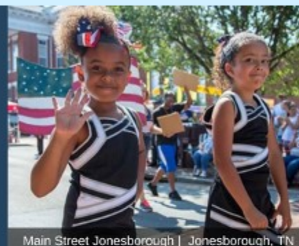
Main Street Jonesborough | Jonesborough, TN